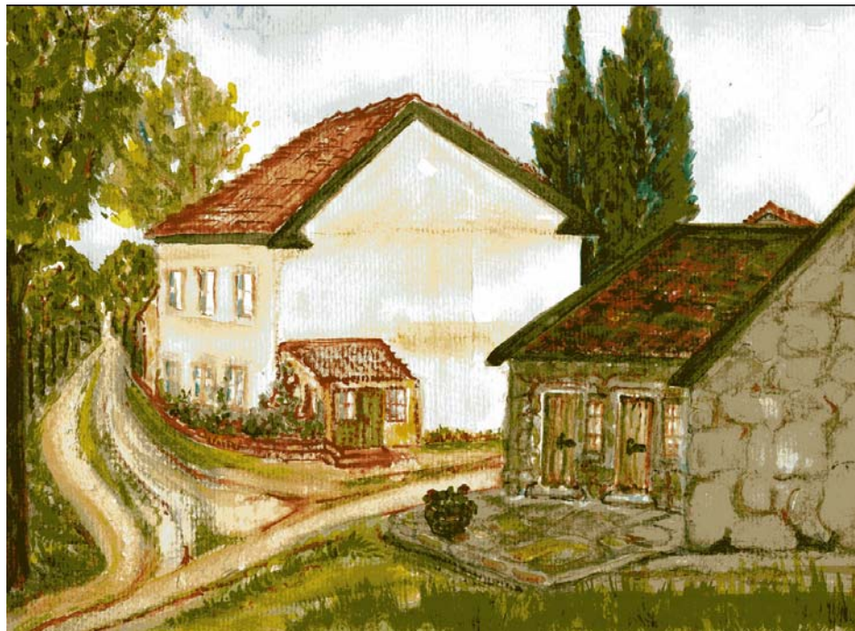
The Mir Sufi Centre, Llwynhaf, Llanddarog Road, Carmarthen, SA32 8AR. Tel:01267 275910

The Mir Sufi Centre is a development set within 33 acres of secluded rural land and woodland situated a few miles from Carmarthen in Wales.